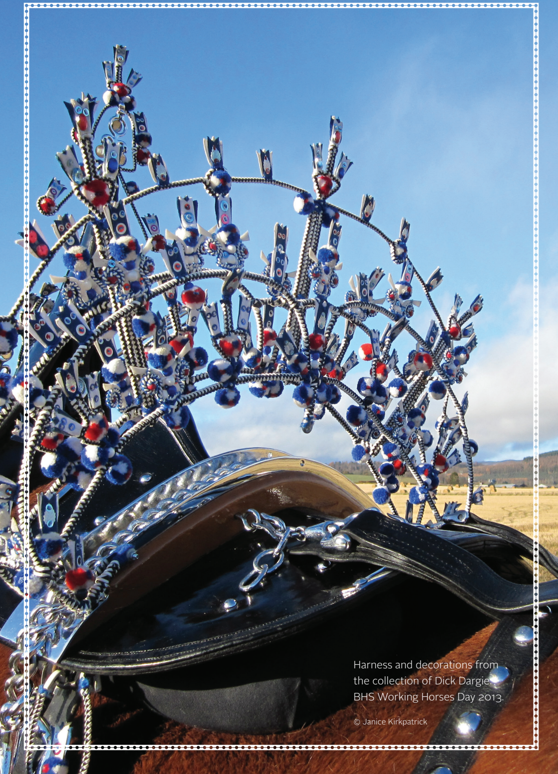
Harness and decorations from the collection of Dick Dargie, BHS Working Horses Day 2013.