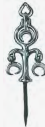
Painting of a nickel-plated 'burler' collar decoration by Janice Kirkpatrick.

Today we will see performed, 'Cereal From Seed to Harvest', using working horses and traditional farming implements, skills and techniques to replicate a traditional farming year in one single day.