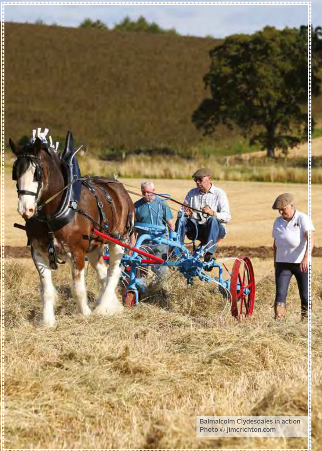
Balmalcolm Clydesdales in action